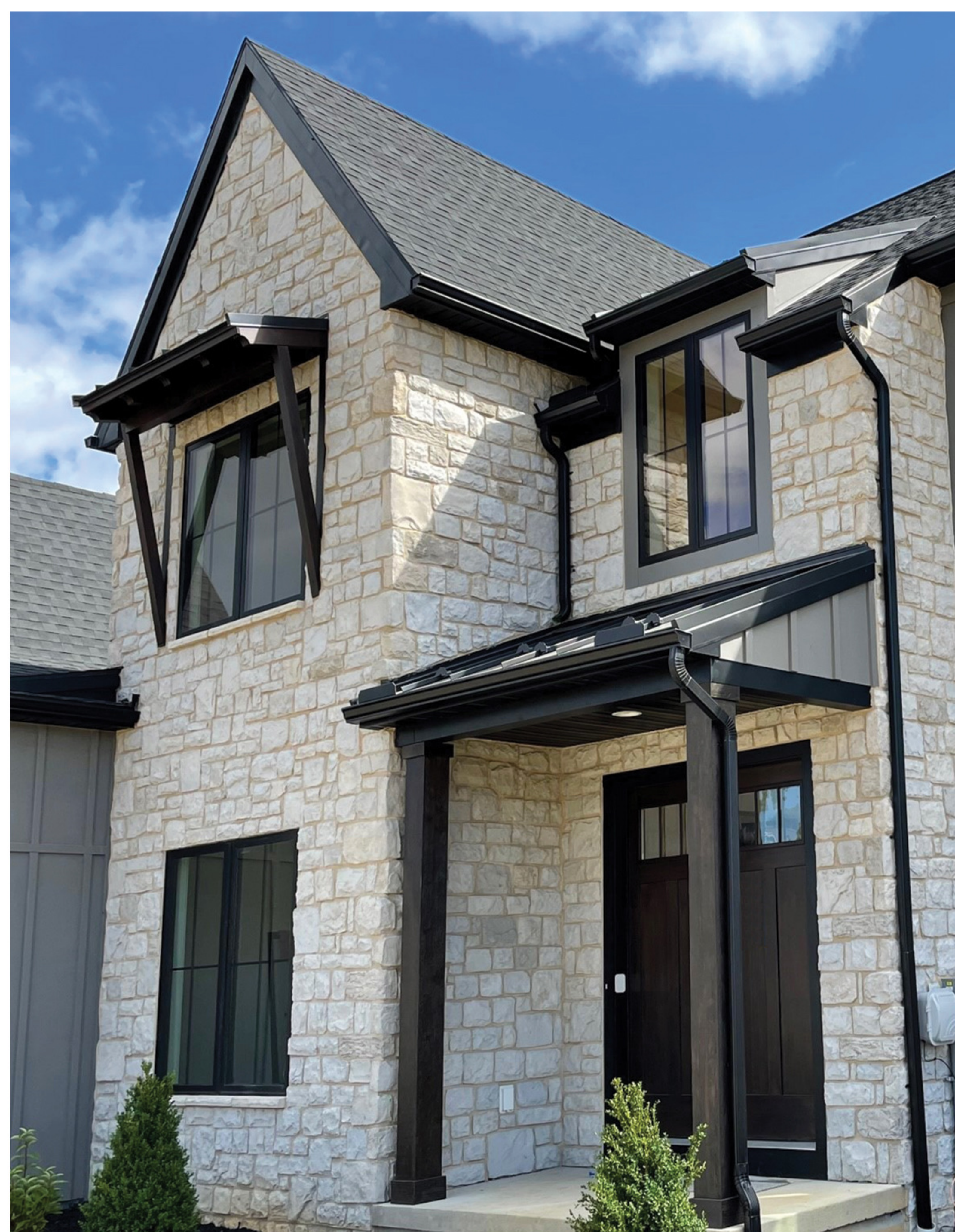
Eggshell Cobblestone with Buff Mortar

Our installation craftsmen are experts of the trade. Installations follow all specifications set by the National Concrete Masonry Association, backed by our 1 Year Installation and 50 Year Product Limited Warranties.